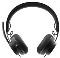
ZONE WIRELESS PLUS