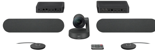
RALLY & RALLY PLUS Part # 960-001217 Plus Part #: 960-001225