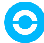
SYNC free cloud-based monitoring and management for Logitech video collaboration gear